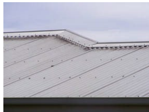
Figure 4. Roof made from COLORBOND® steel showing spotty lichen and fungus growth spread across the structure